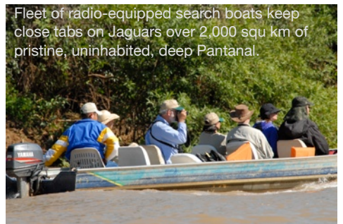
Fleet of radio-equipped search boats keep close tabs on Jaguars over 2,000 sq km of pristine, uninhabited, deep Pantanal.