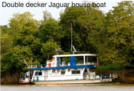
Double decker Jaguar house boat

Since June 2007 our crack team of trackers has shown 54 Jaguars to JRC guests in 39 days of searching. On 4 August we had 7 Jaguars.