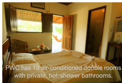
PWC has 13 air-conditioned double rooms with private, hot-shower bathrooms.