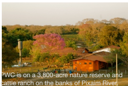
PWC is on a 3,800-acre nature reserve and cattle ranch on the banks of Pixaim River.

Quite likely the Pantanal's leading wildlife lodge, PWC is an air-conditioned, 13-room hotel found only two hours by all-season road from the major jetport of Cuiabá. The lodge is ideally located on the banks of the narrow, wildlife-rich Pixaim River, the only navigable body of water on the Transpantaneira Road until its terminus at the mighty São Lourenço (or Cuiabá) River, the site of JRC. The Transpantaneira is the only year-round road that penetrates the core of the Pantanal. PWC is the only wildlife lodge in Brazil owned and operated by internationally-known conservation biologists, who wrote and appeared in cover stories for National Geographic Magazine. The lodge offers high-speed, wireless internet, the Pantanal's only electric photo catamarans, the world's only observation towers at nests of Jabiru Stork and Great Potoo, the Pantanal's only mobile observation towers at other nests or at fruiting and flowering trees, a network of scientifically-designed trails in mature gallery forest (a very rare habitat in Pantanal), and a series of other unique features that combine the best of field research, wildlife filmmaking, and hospitality.